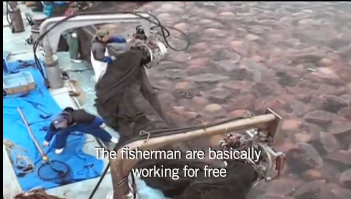
The fisherman are basically working for free

Understanding what was happening wasn't easy because gathering data on us was so difficult for them. Even though 70% of their planet was covered by ocean, they really only had a hazy idea about most of the life. Our ancestors mostly inhabited open oceans and deep waters, so, they could remain an enigma in many ways. There's no way they could monitor individuals or family blooms by satellite because we're so transparent – we have very low biomass, and anyway we swam in deeper waters than their satellites could reach.